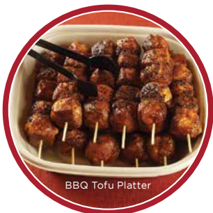
BBQ Tofu Platter