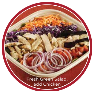
Fresh Green Salad, add Chicken