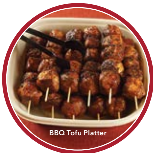
BBQ Tofu Platter