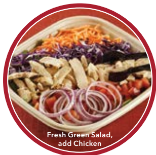
Fresh Green Salad, add Chicken