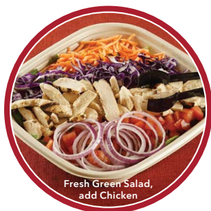
Fresh Green Salad, add Chicken