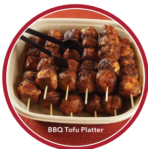
BBQ Tofu Platter