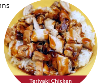
Teriyaki Chicken & Rice

Add-ons for Yumm! Kids $2.50 All-Natural Chicken (80 cal.) $2.50 Organic Tofu, Original (93 cal.) $1.00 Fresh Avocado Slices (45 cal.) $1.00 Shredded Cheddar (110 cal.) $1.00 Diced Tomato (10 cal.) $1.00 Black Olives (33 cal.)