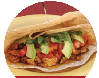
Southwest Wrap™ with Chicken

Southwest Wrap™ $11.95 All-Natural Chicken (769 cal.) $10.95 Organic Tofu (864 cal.) Cheddar Cheese · Avocado · Tomato Fresh Mild Red Salsa · Cilantro Folded into a grilled, open-face tortilla with melted cheddar.