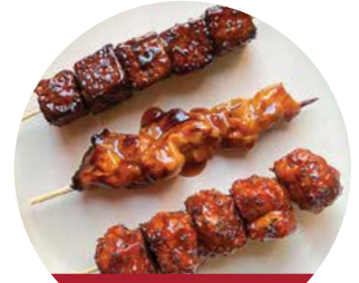
Tempeh, Chicken, and Tofu

Teriyaki Chicken $5.00 (259 cal.) All-Natural Chicken