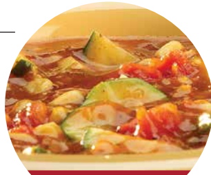
Chilean Zucchini™ Stew