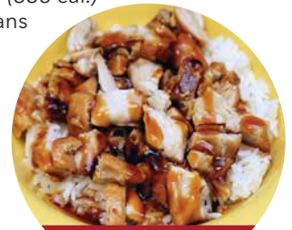
Teriyaki Chicken & Rice

Teriyaki Chicken & Rice $6.45 (464 cal.) Teriyaki All-Natural Chicken Thai Jasmine Rice · Teriyaki Sauce