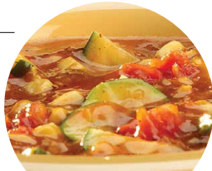
Chilean Zucchini™ Stew