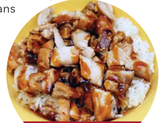
Teriyaki Chicken & Rice

Kid Quesadilla $5.50 (588 cal.) White or Whole Wheat Tortilla · Cheddar Cheese Unlike Cheese Quesadilla, does not include salsa and sour cream.