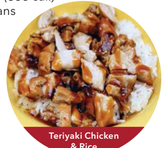
Teriyaki Chicken & Rice

Teriyaki Chicken & Rice $6.50 (464 cal.) Teriyaki All-Natural Chicken Thai Jasmine Rice · Teriyaki Sauce