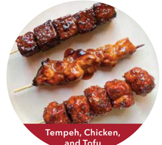
Tempeh, Chicken, and Tofu

Teriyaki Chicken $5.00 (259 cal.) All-Natural Chicken