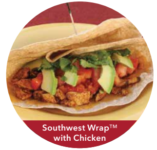
Southwest Wrap™ with Chicken

Southwest Wrap™ $11.95 All-Natural Chicken (769 cal.) $10.95 Organic Tofu (864 cal.) Cheddar Cheese · Avocado · Tomato Fresh Mild Red Salsa · Cilantro Folded into a grilled, open-face tortilla with melted cheddar.