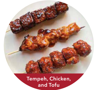
Tempeh, Chicken, and Tofu

Teriyaki Chicken $5.00 (259 cal.) All-Natural Chicken