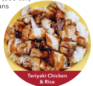
Teriyaki Chicken & Rice

Teriyaki Chicken & Rice $6.45 (464 cal.) Teriyaki All-Natural Chicken Thai Jasmine Rice · Teriyaki Sauce