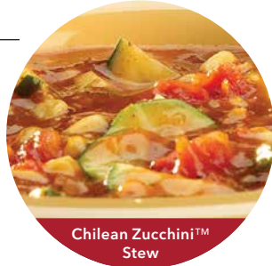
Chilean Zucchini™ Stew

House Soups $6.95 Cup (120-220 cal.) $8.95 Bowl (180-330 cal.) Served with baguette roll and butter.