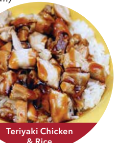
Teriyaki Chicken & Rice

Served in a bigger bowl to help kids avoid the "Oops!"