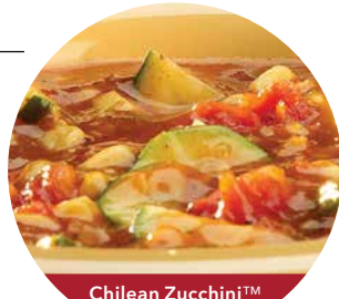
Chilean Zucchini™ Stew