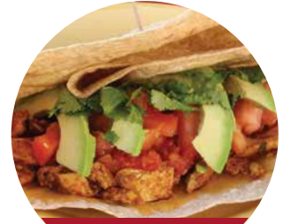
Southwest Wrap™ with Chicken

Southwest Wrap™ $11.95 All-Natural Chicken (769 cal.) $10.95 Organic Tofu (864 cal.) Cheddar Cheese · Avocado · Tomato Fresh Mild Red Salsa · Cilantro Folded into a grilled, open-face tortilla with melted cheddar.