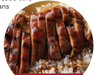
Teriyaki Chicken & Rice

Teriyaki Chicken & Rice $6.45 (411 cal.) Teriyaki All-Natural Chicken Thai Jasmine Rice · Teriyaki Sauce