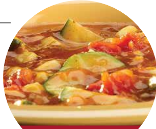
Chilean Zucchini™ Stew

House Soups $6.95 Cup (120-220 cal.) $8.95 Bowl (180-330 cal.) Served with baguette roll and butter.