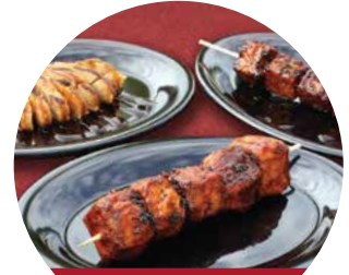
Tempeh, Tofu, and Chicken

Teriyaki Chicken $4.00 (206 cal.) All-Natural Chicken