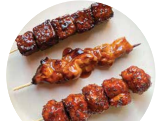
Tempeh, Chicken, and Tofu

Teriyaki Chicken $5.00 (259 cal.) All-Natural Chicken