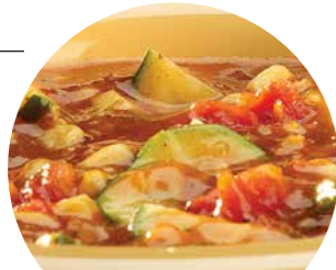
Chilean Zucchini™ Stew