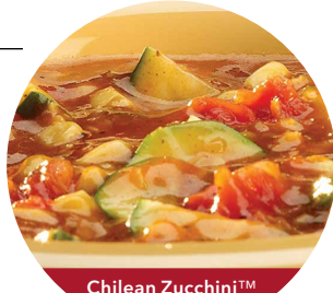
Chilean Zucchini™ Stew

House Soups $7.00 Cup (120-220 cal.) $9.00 Bowl (180-330 cal.) Served with baguette roll and butter.