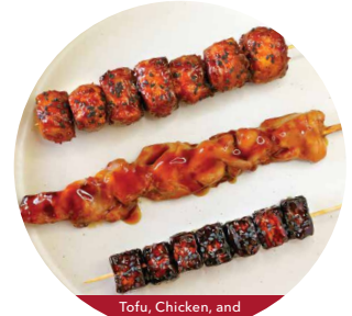
Tofu, Chicken, and Tempeh

Teriyaki Tempeh $5.00 (393 cal.) Organic Tempeh