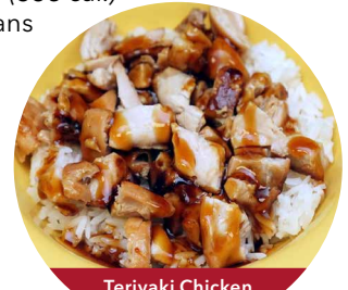
Teriyaki Chicken & Rice

Teriyaki Chicken & Rice $7.50 (464 cal.) Teriyaki All-Natural Chicken Thai Jasmine Rice · Teriyaki Sauce