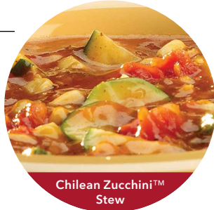
Chilean Zucchini™ Stew