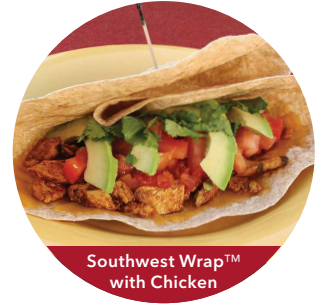
Southwest Wrap™ with Chicken

Southwest Wrap™ $13.50 All-Natural Chicken (769 cal.) $12.50 Organic Tofu (864 cal.) Cheddar Cheese · Avocado · Tomato Fresh Mild Red Salsa · Cilantro Folded into a grilled, open-face tortilla with melted cheddar.