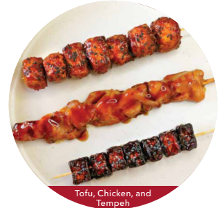
Tofu, Chicken, and Tempeh

Teriyaki Chicken $5.00 (259 cal.) All-Natural Chicken