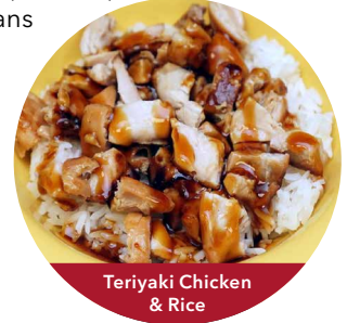
Teriyaki Chicken & Rice

Kid Quesadilla $5.50 (588 cal.) White or Whole Wheat Tortilla · Cheddar Cheese Unlike Cheese Quesadilla, does not include salsa and sour cream.