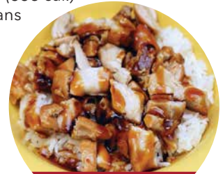
Teriyaki Chicken & Rice

Served in a bigger bowl to help kids avoid the "Oops!"