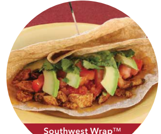
Southwest Wrap™ with Chicken

Southwest Wrap™ $13.00 All-Natural Chicken (769 cal.) $12.00 Organic Tofu (864 cal.) Cheddar Cheese · Avocado · Tomato Fresh Mild Red Salsa · Cilantro Folded into a grilled, open-face tortilla with melted cheddar.