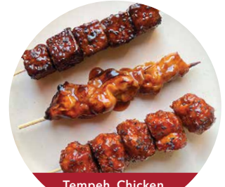
Tempeh, Chicken, and Tofu

Teriyaki Tempeh $4.50 (393 cal.) Organic Tempeh