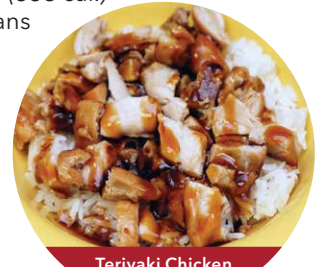
Teriyaki Chicken & Rice

Teriyaki Chicken & Rice $6.50 (464 cal.) Teriyaki All-Natural Chicken Thai Jasmine Rice · Teriyaki Sauce