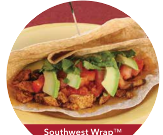
Southwest Wrap™ with Chicken

Southwest Wrap™ $13.00 All-Natural Chicken (769 cal.) $12.00 Organic Tofu (864 cal.) Cheddar Cheese · Avocado · Tomato Fresh Mild Red Salsa · Cilantro Folded into a grilled, open-face tortilla with melted cheddar.