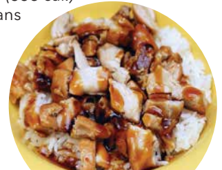
Teriyaki Chicken & Rice

Teriyaki Chicken & Rice $6.50 (464 cal.) Teriyaki All-Natural Chicken Thai Jasmine Rice · Teriyaki Sauce