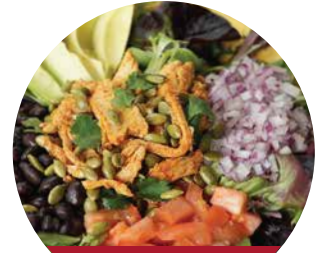
Southwest Wrap™ with Chicken

Southwest Wrap™ $11.95 All-Natural Chicken (769 cal.) $10.95 Organic Tofu (864 cal.) Cheddar Cheese · Avocado · Tomato Fresh Mild Red Salsa · Cilantro Folded into a grilled, open-face tortilla with melted cheddar.