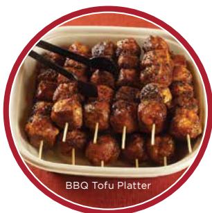
BBQ Tofu Platter