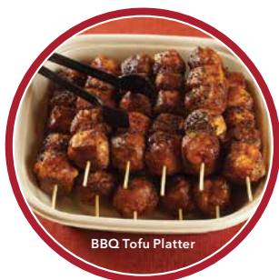
BBQ Tofu Platter