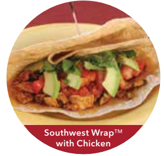
Southwest Wrap™ with Chicken

Southwest Wrap™ $13.00 All-Natural Chicken (769 cal.) $12.00 Organic Tofu (864 cal.) Cheddar Cheese · Avocado · Tomato Fresh Mild Red Salsa · Cilantro Folded into a grilled, open-face tortilla with melted cheddar.