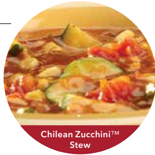
Chilean Zucchini™ Stew

House Soups $7.00 Cup (120-220 cal.) $9.00 Bowl (180-330 cal.) Served with baguette roll and butter.