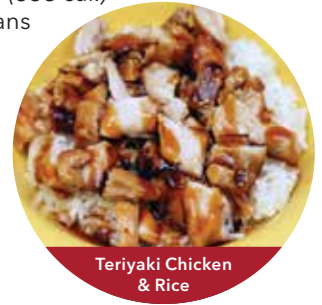
Teriyaki Chicken & Rice

Teriyaki Chicken & Rice $6.50 (464 cal.) Teriyaki All-Natural Chicken Thai Jasmine Rice · Teriyaki Sauce