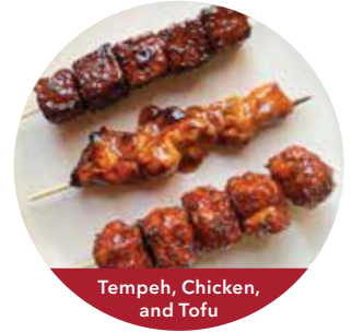
Tempeh, Chicken, and Tofu

Teriyaki Chicken $5.00 (259 cal.) All-Natural Chicken