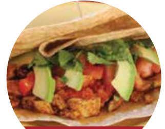
Southwest Wrap™ with Chicken

Southwest Wrap™ $10.45 All-Natural Chicken (769 cal.) $9.45 Organic Tofu (864 cal.) Cheddar Cheese · Avocado · Tomato Fresh Mild Red Salsa · Cilantro Folded into a grilled, open-face tortilla with melted cheddar.