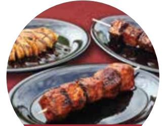
Tempeh, Tofu, and Chicken

Teriyaki Tempeh Skewer $3.75 (393 cal.) Organic Tempeh