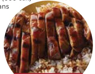
Teriyaki Chicken & Rice

Teriyaki Chicken & Rice $6.25 (411 cal.) Teriyaki All-Natural Chicken Thai Jasmine Rice · Teriyaki Sauce