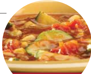
Chilean Zucchini™ Stew

House Soups $5.95 Cup (120-220 cal.) $6.95 Bowl (180-330 cal.) Served with baguette roll and butter.