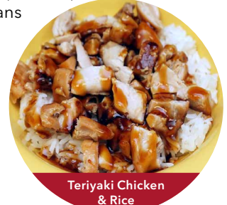
Teriyaki Chicken & Rice

Kid Quesadilla $5.50 (588 cal.) White or Whole Wheat Tortilla · Cheddar Cheese Unlike Cheese Quesadilla, does not include salsa and sour cream.